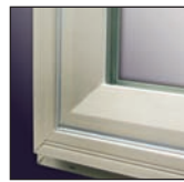
Stylish Beveled Frame