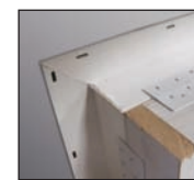
Optional New Construction Fin