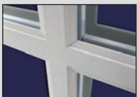
SDL Simulated Divided Lites

Our SDL option includes contour grids mounted on the exterior of the glass with a high bond adhesive system. A shadow bar placed between the panes of insulated glass completes the look.