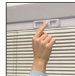
LIFT AND TILT PRIVACY BLINDS