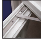
Optional Stainless Steel Hardware