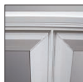
Continuous Master Frame